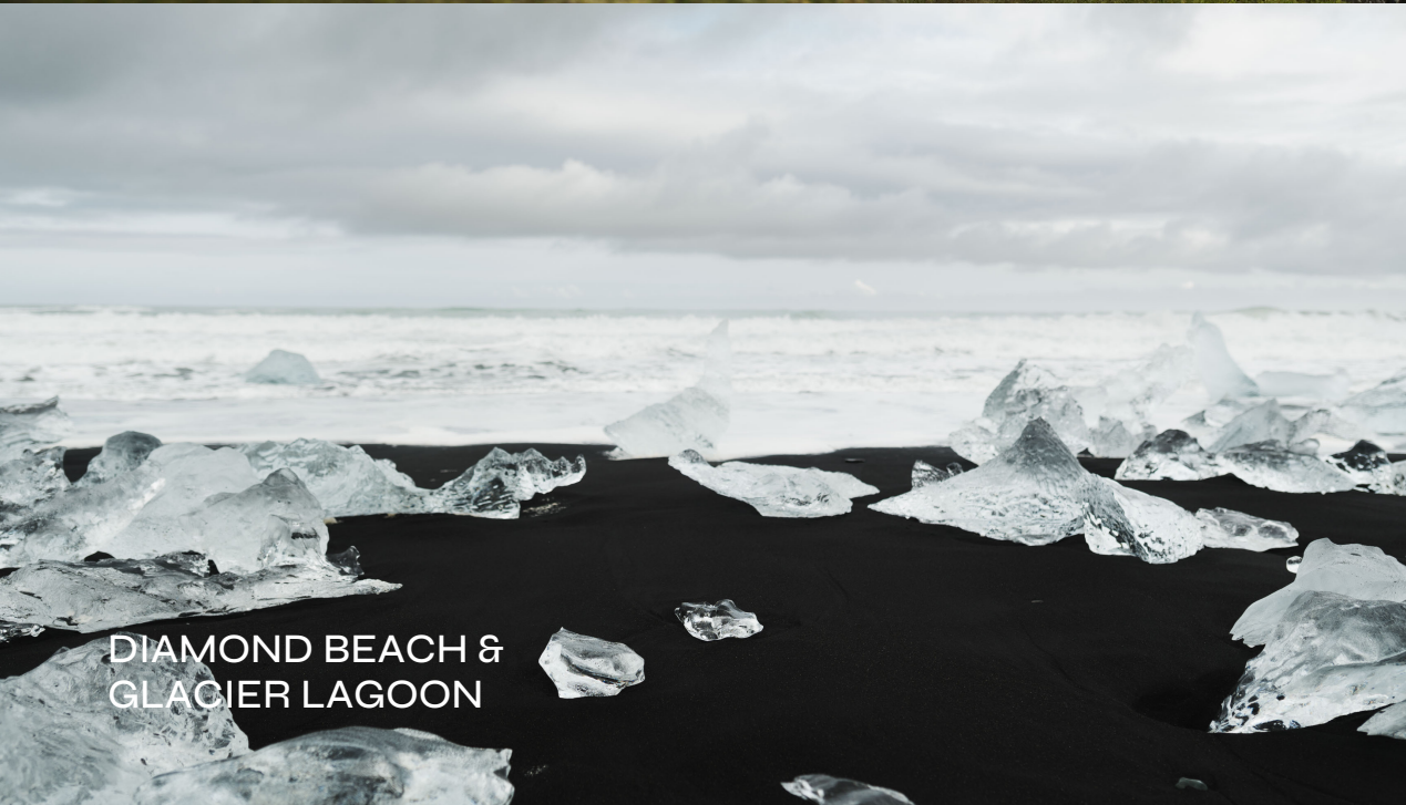
DIAMOND BEACH & GLACIER LAGOON