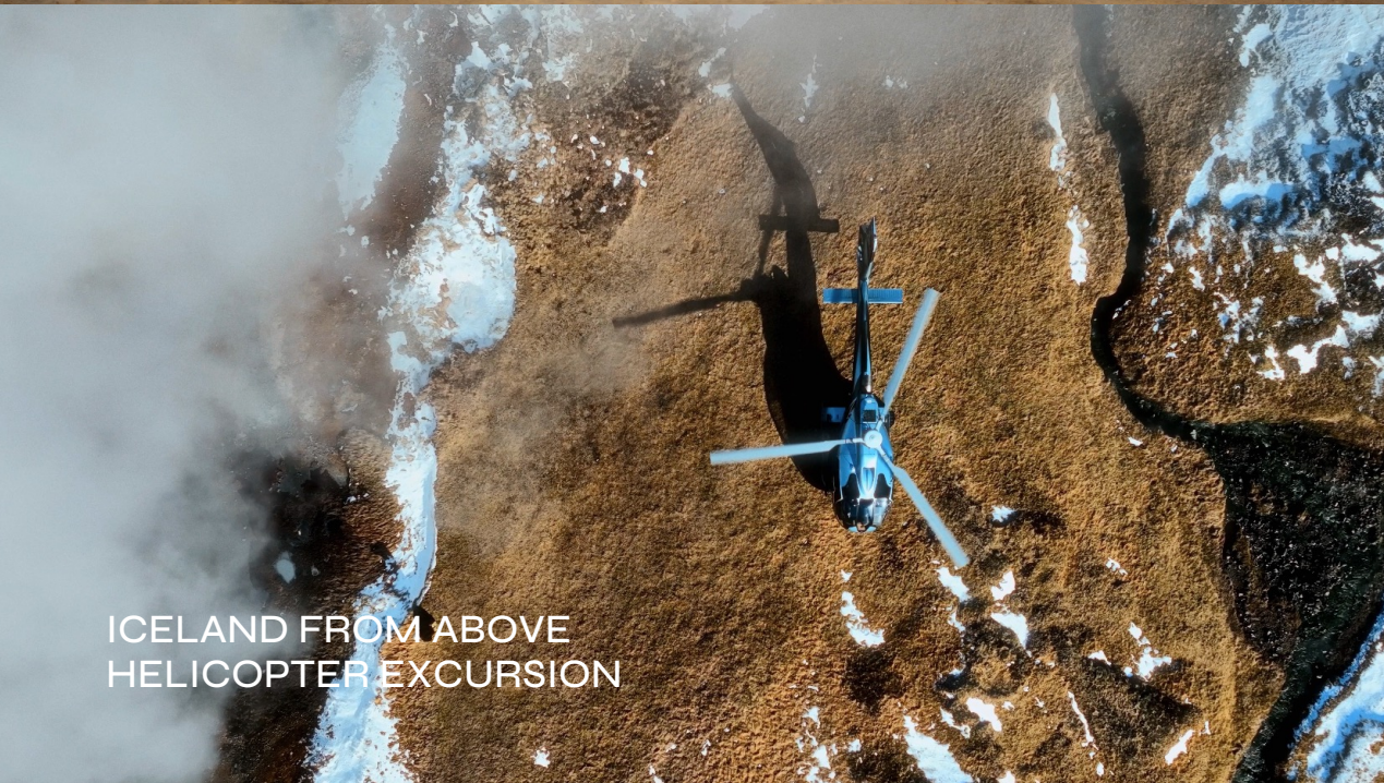
ICELAND FROM ABOVE HELICOPTER EXCURSION